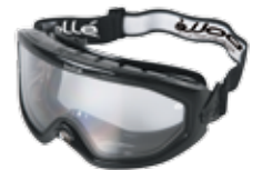
1650708 • Charcoal Frame with SBR Foam / Clear Duo Lens / Clear Mouth Guard / No vents / No Notch / Fully Foam Seal