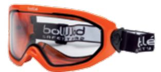
1669211 • Orange Frame with SBR Foam / Clear Duo Lens / No vents / No Notch / Fully Foam Seal